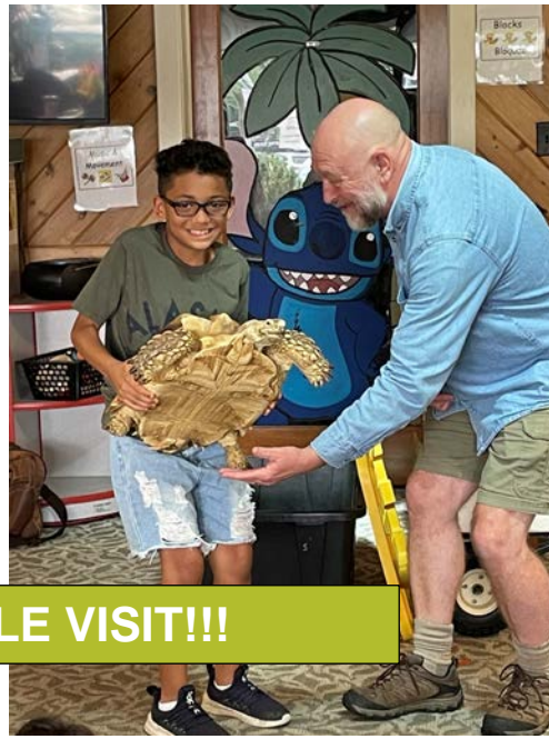
P.T REPTILE VISIT!!!