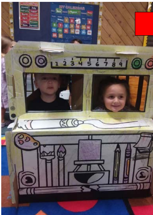
Build a School Bus