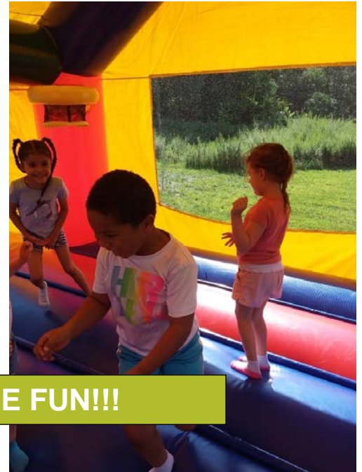
BOUNCE HOUSE FUN!!!